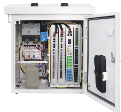
2pcs OLT module and 1pcs EYDFA module installed