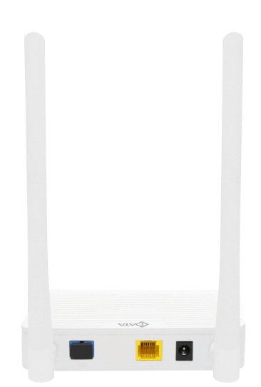
Optional Shell Supply