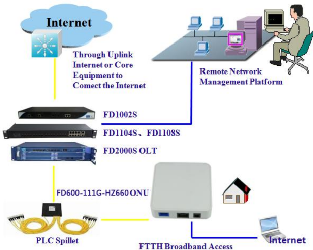
Figure: FD600-111G-HZ660 Application Diagram