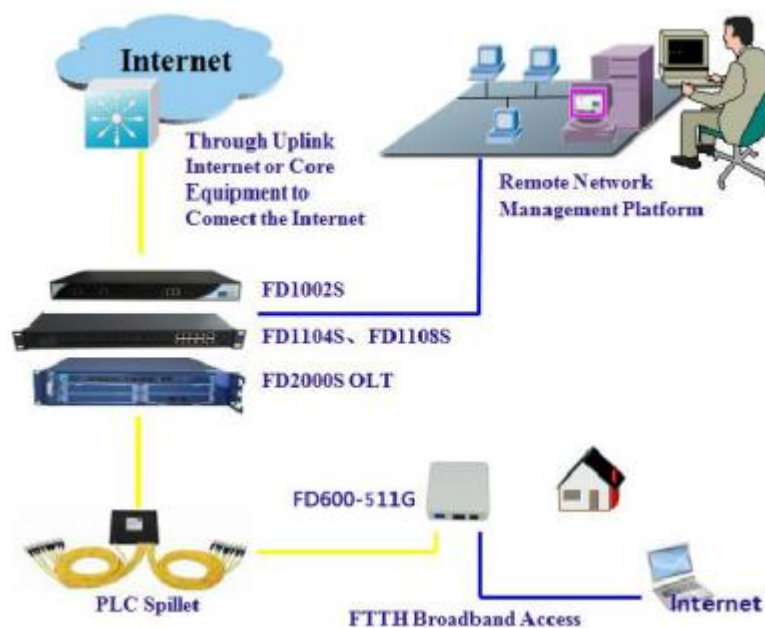
Figure: FD600-511G-HZ660 Application Diagram