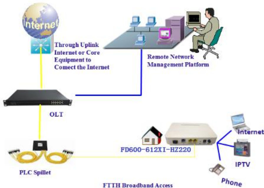
Figure: FD612H Application Diagram